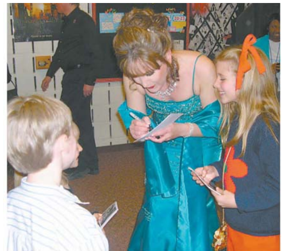
Jodi Benson - the voice of Ariel in Disney's classic animated movie The Little Mermaid - signs autographs for her young fans backstage post-performance.